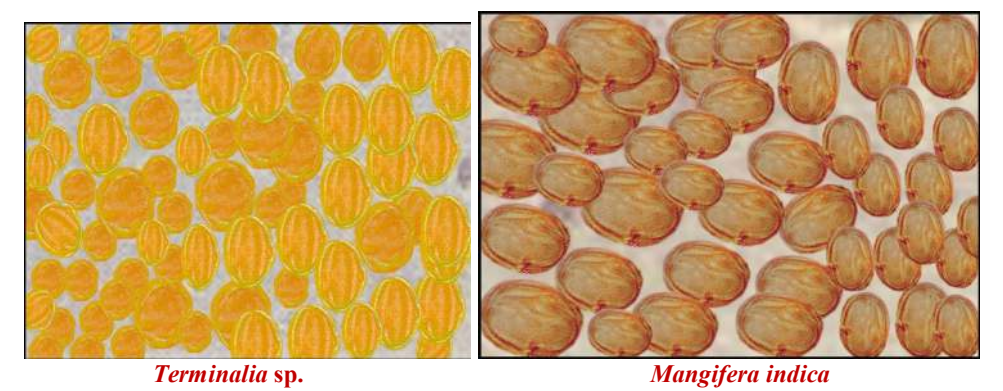
Figure 1: Pollen types in Unifloral Pollen Load.